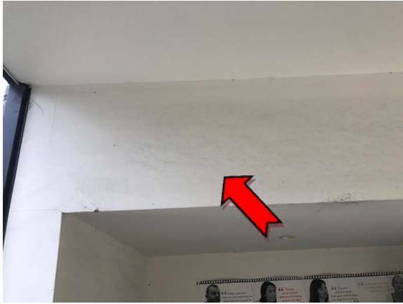
Photo 1. Exterior, northern elevation, walls – non asbestos-containing fibre cement sheeting.